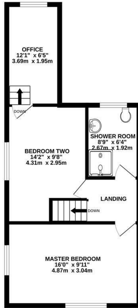
1ST FLOOR 463 sq.ft. (43.0 sq.m.) approx.