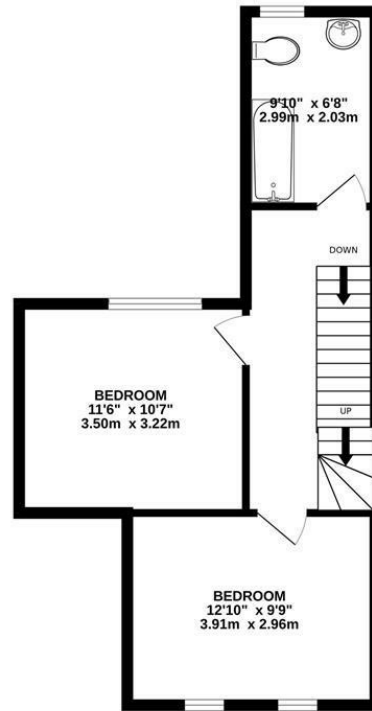
1ST FLOOR 410 sq.ft. (38.0 sq.m.) approx.