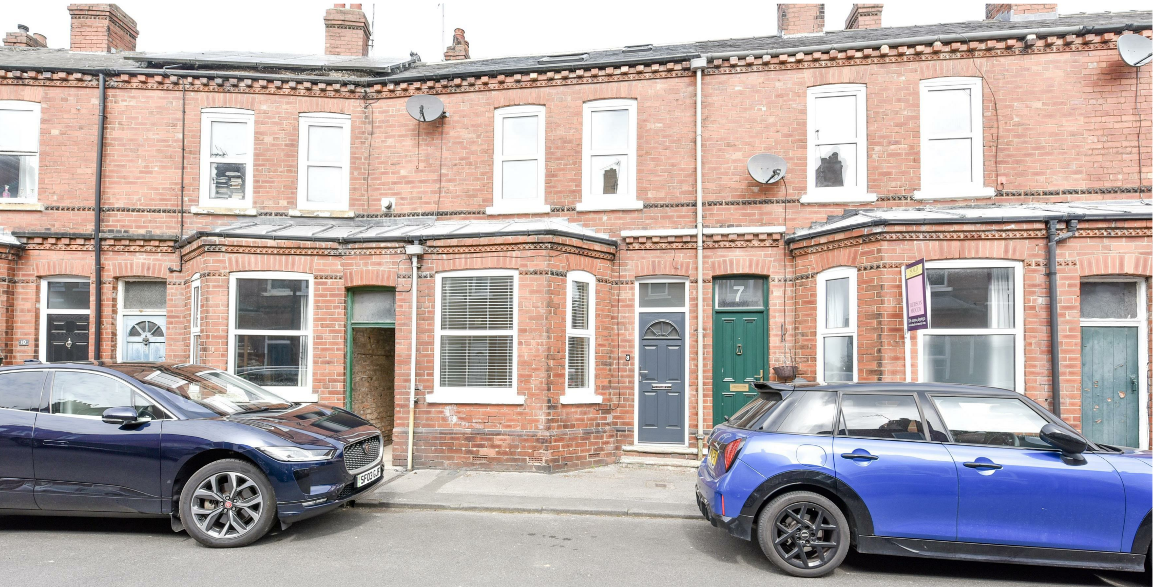
8 Prospect Terrace, Fulford, York, YO10 4PT £1,400 Per Month