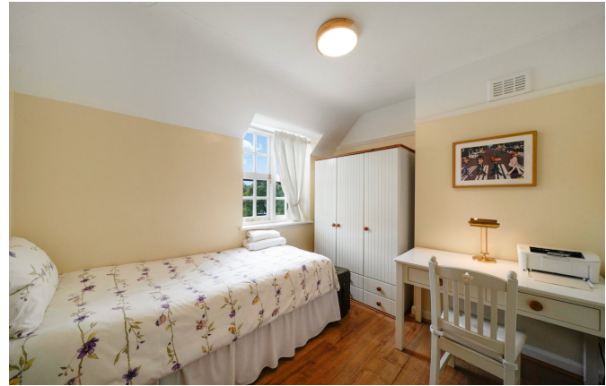
ASMUNS PLACE, NW11