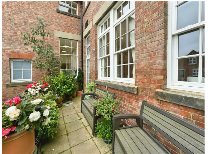
VIEW FROM TERRACE