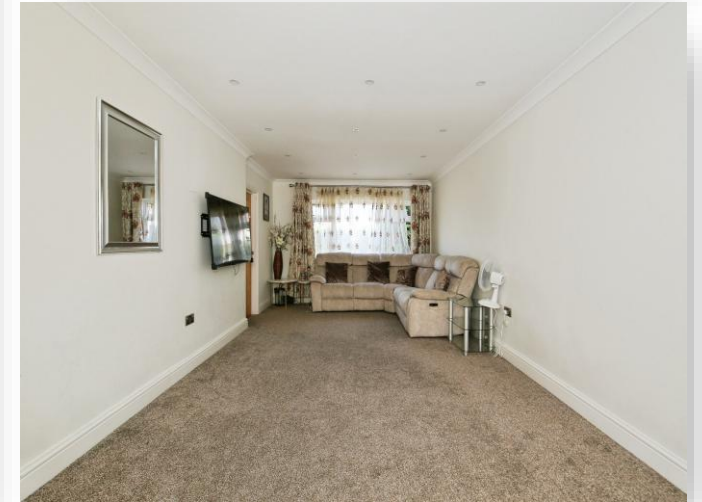
Welland Road, Dogsthorpe Peterborough PE1 3SH