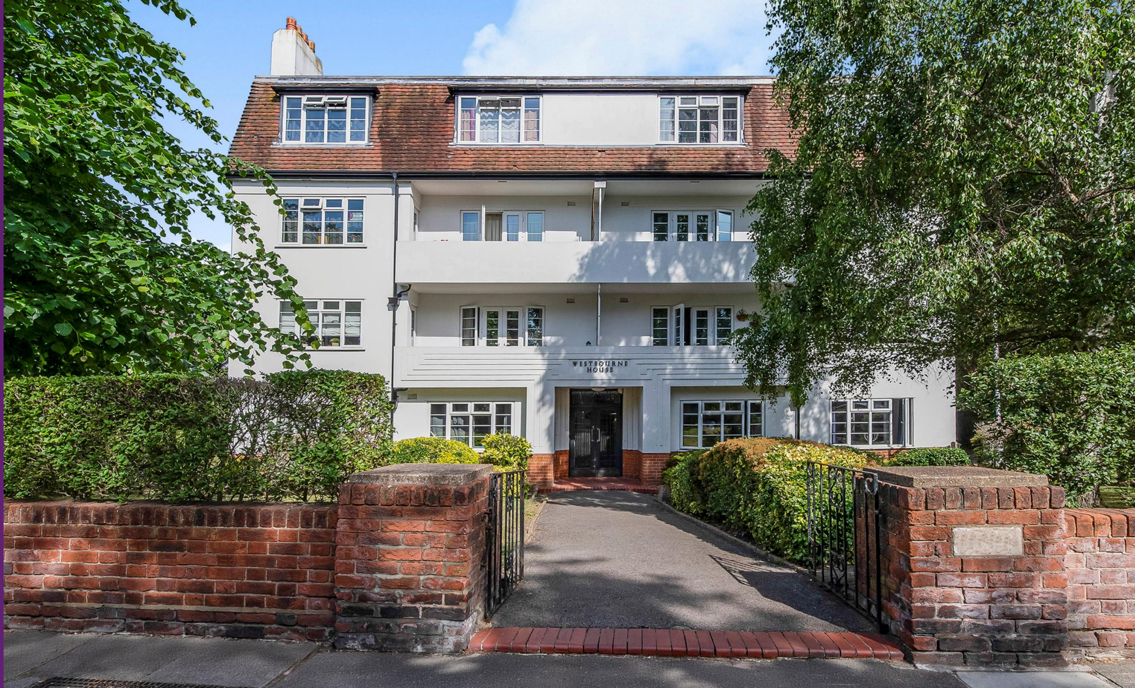
Westbourne House Richmond Road, TW1