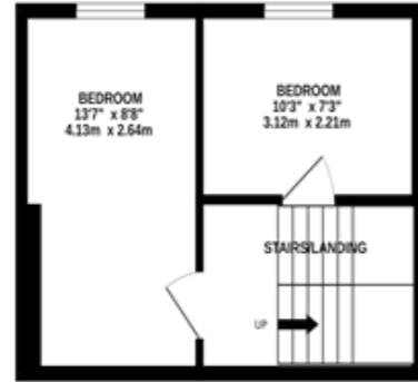
1ST FLOOR 254 sq.ft. (23.6 sq.m.) approx.