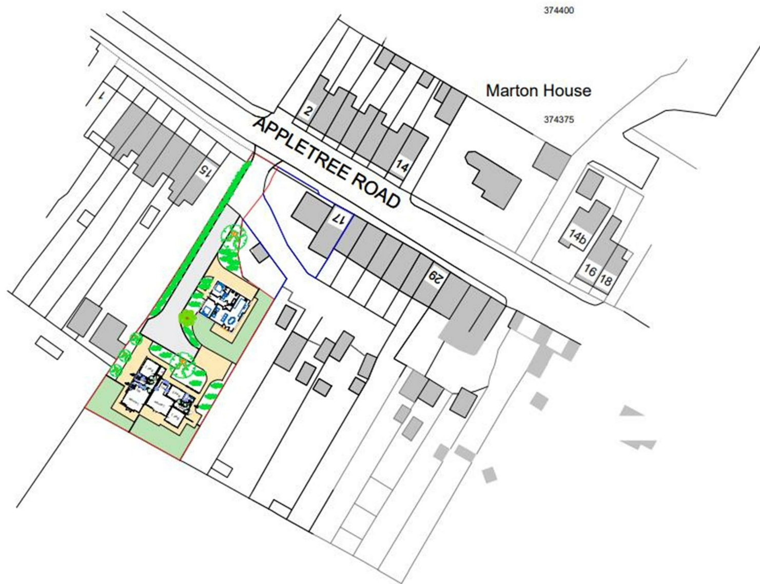
Proposed Site Layout