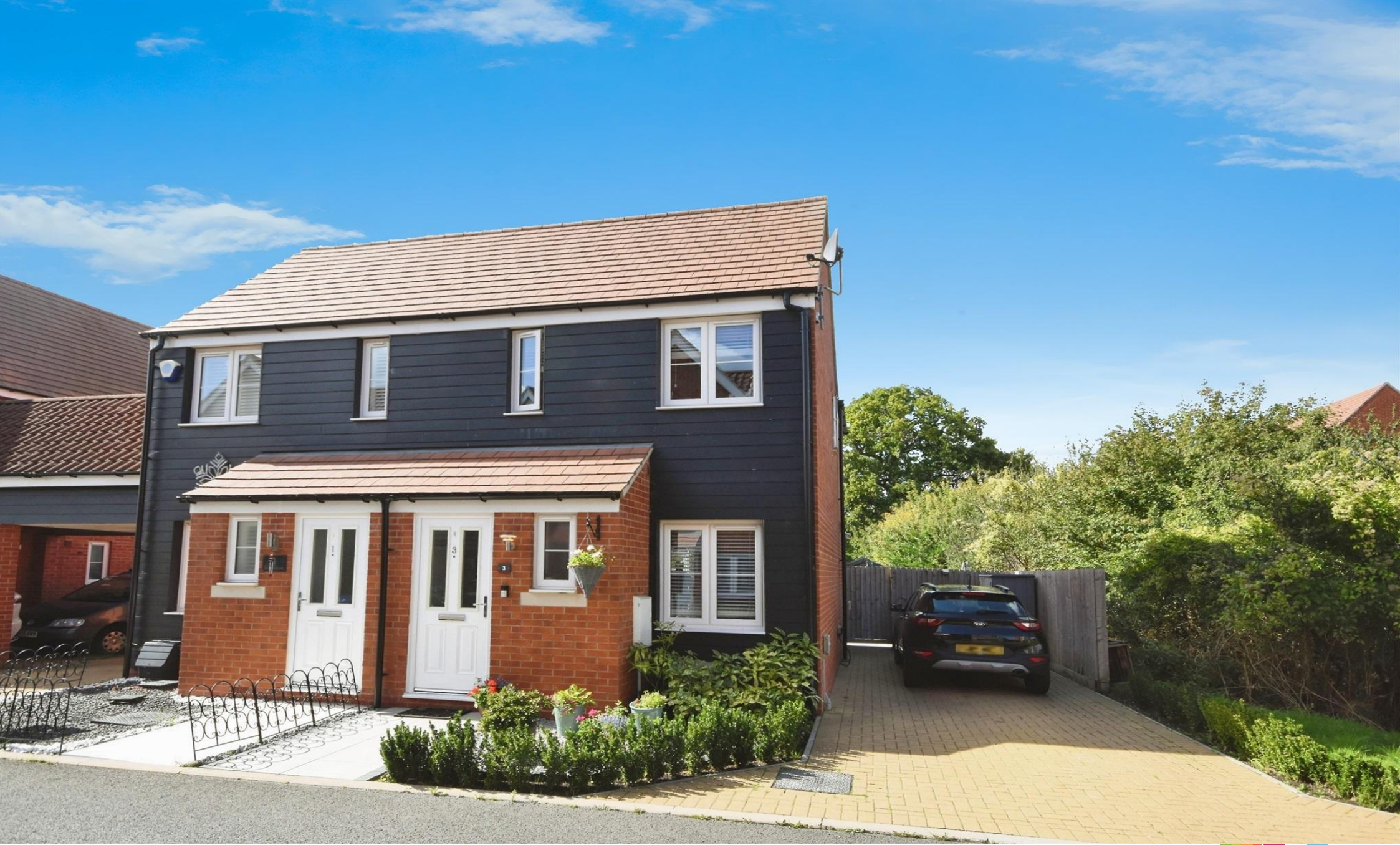
Elder Close, Chelmsford CM1 4FU