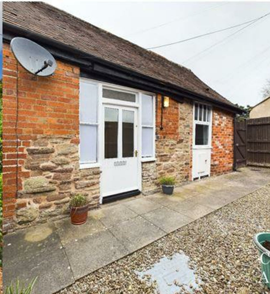
The Printing Works & The Courtyard, Leominster, HR6 8AE Price £320,000