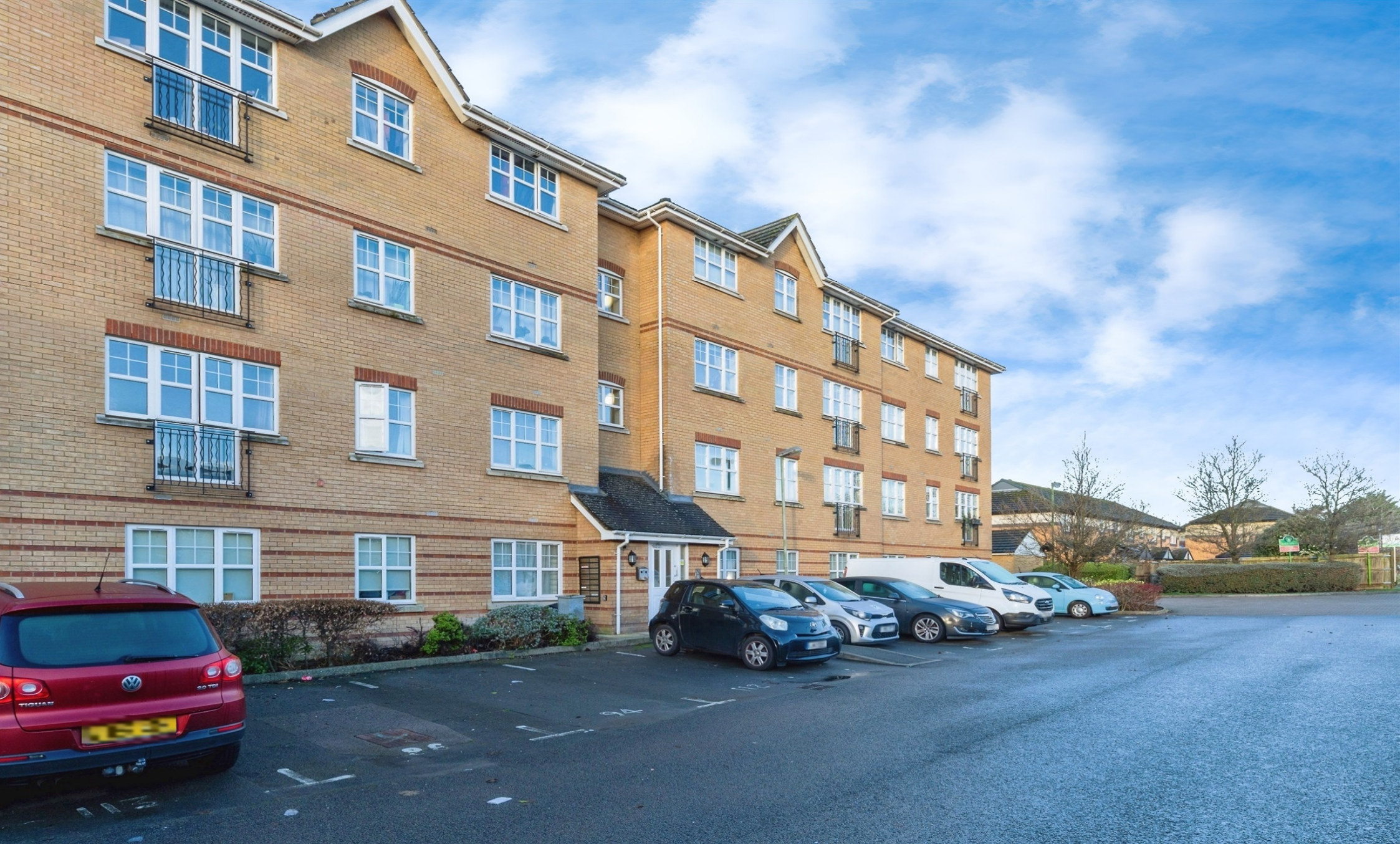
Saxon House Aylward Drive, Stevenage SG2 8UY