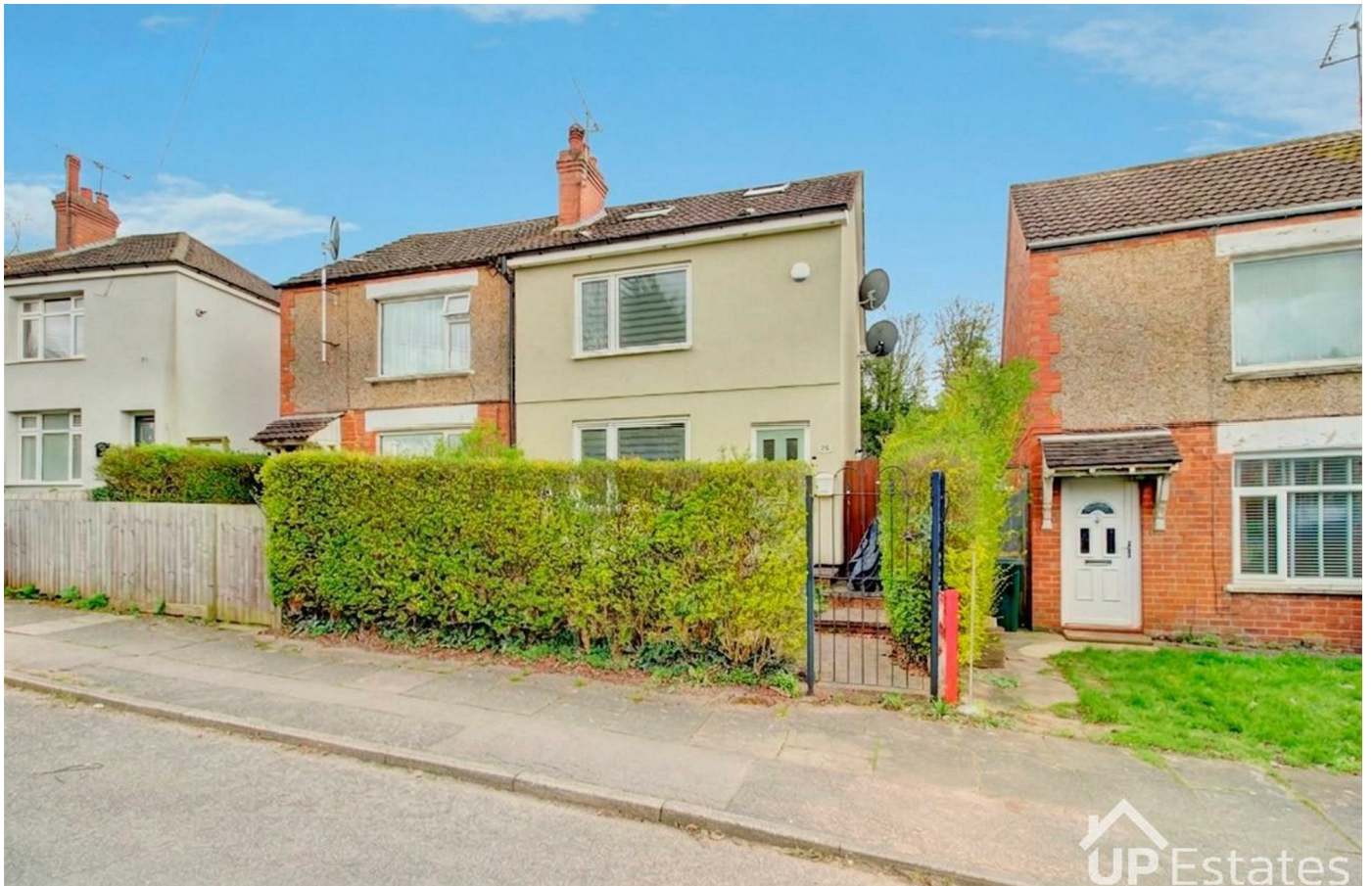
Bridgeman Road, Coventry