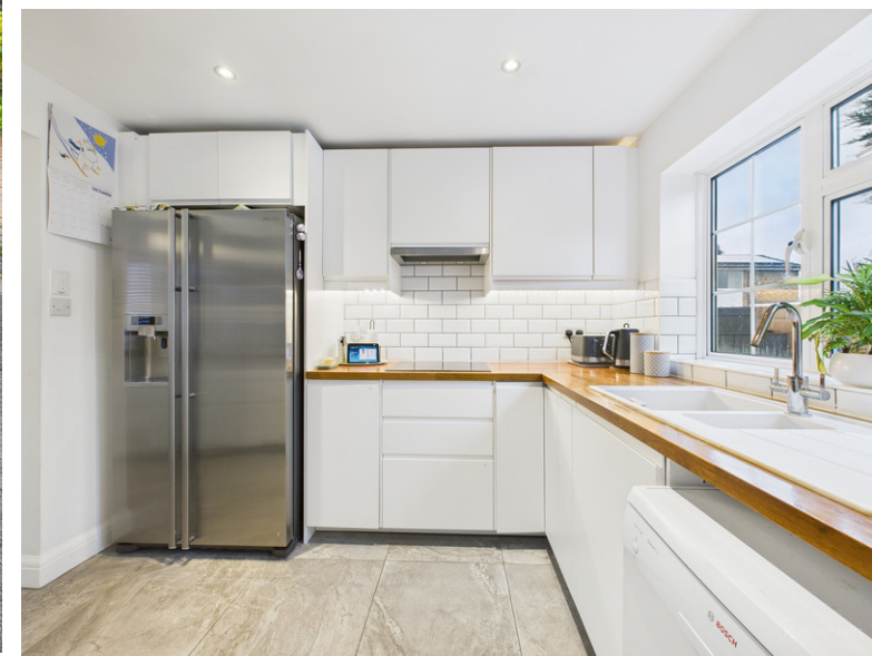
1 Chilton Close, Holmer Green, Buckinghamshire, HP15 6XH