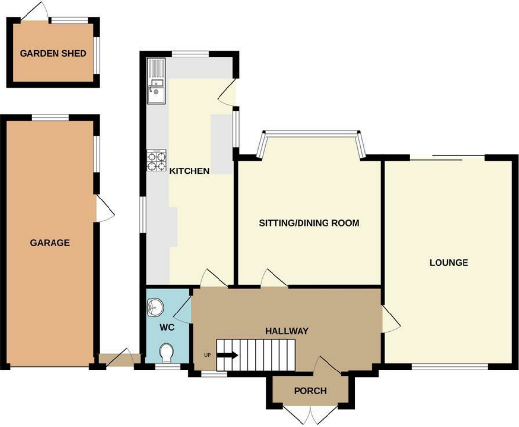
GROUND FLOOR 988 sq.ft. (91.8 sq.m.) approx.