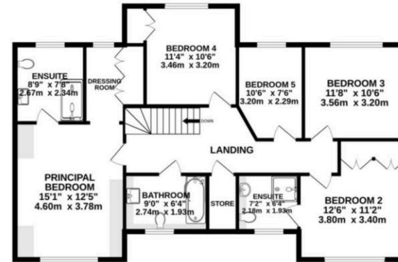
1ST FLOOR 1086 sq.ft. (100.9 sq.m.) approx.