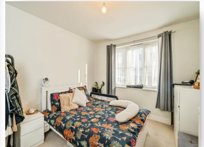
Overbeck House Kelmescott Way, Bognor Regis PO21 5DU