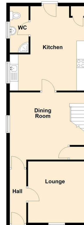
Ground Floor Approx. 56.6 sq. metres (608.9 sq. feet)