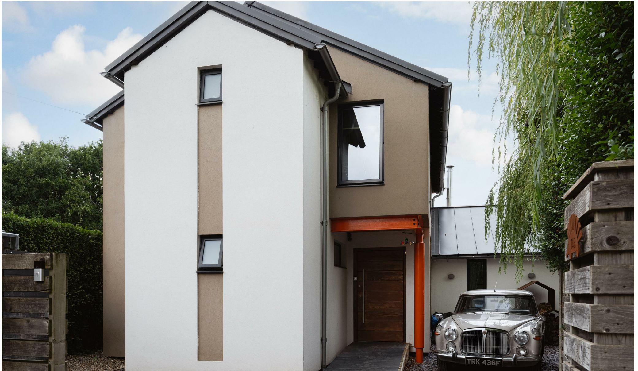
Hedgehog Gate, Masons Bridge Road