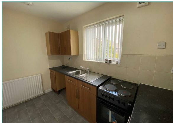
Arden Street Coventry , CV5 6FD £925 PCM