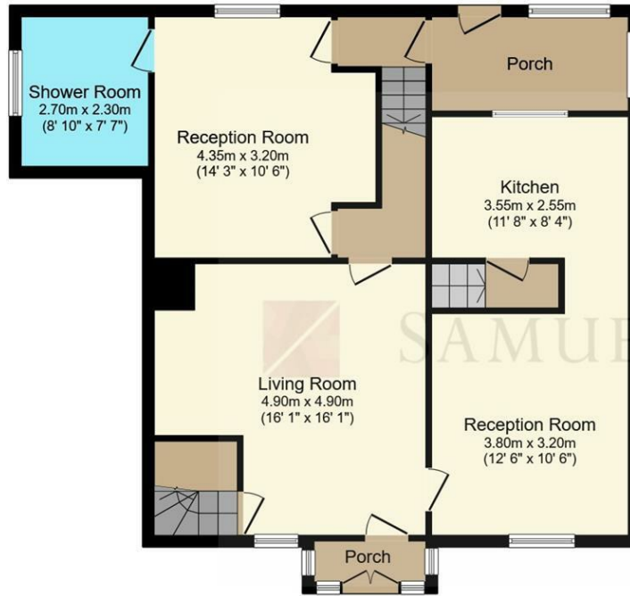
Ground Floor Floor area 88.1 m 2 (948 sq.ft.)