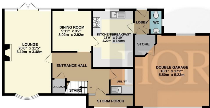
GROUND FLOOR 997 sq.ft. (92.6 sq.m.) approx.