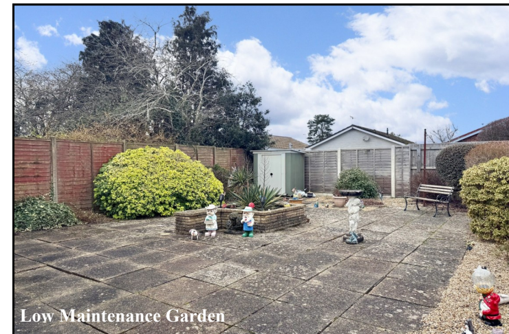
Low Maintenance Garden