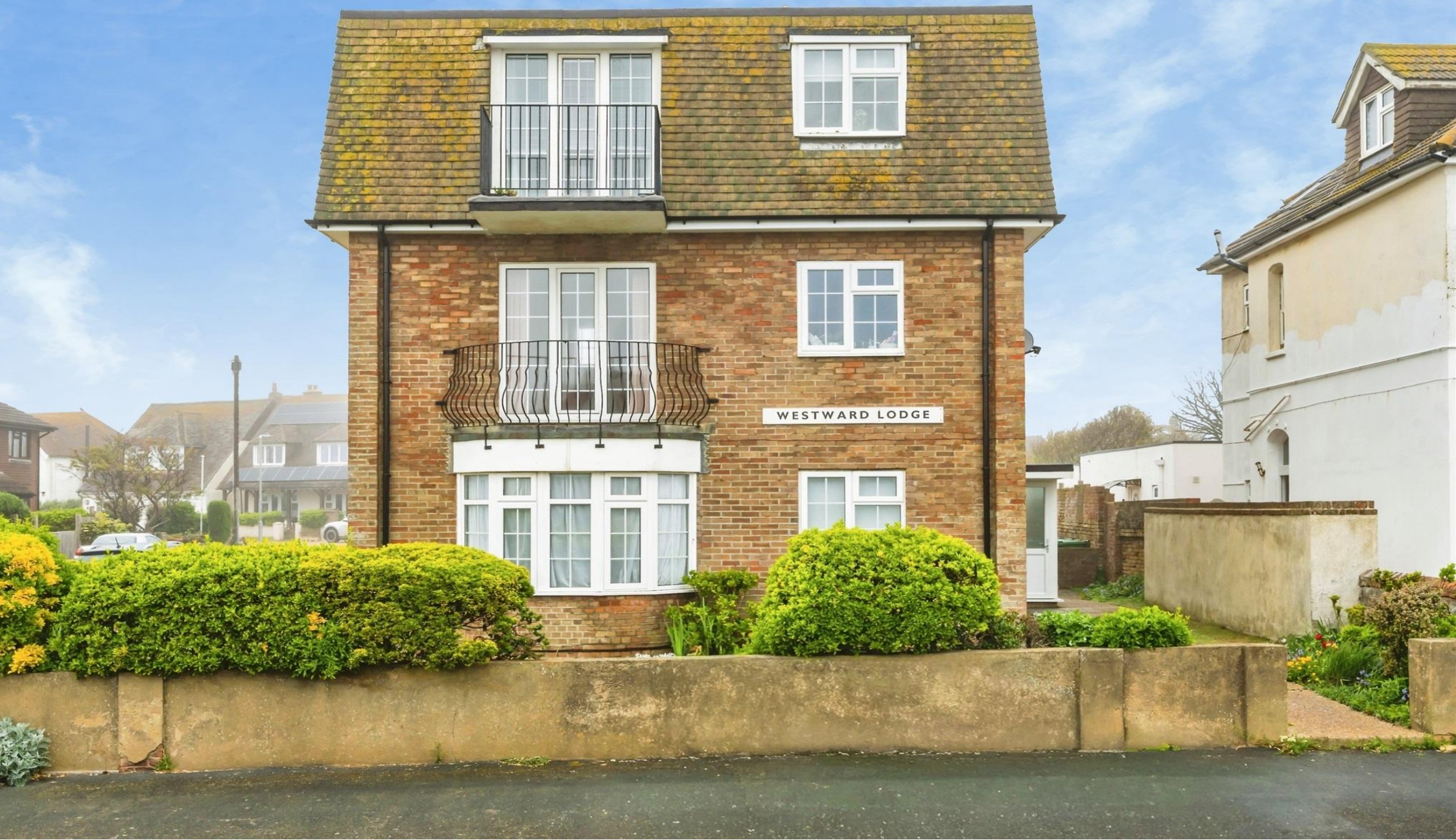
Westward Lodge, Claremont Road, Seaford, BN25 2QD