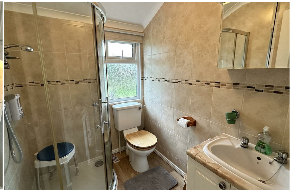
Trevadlock Hall Park, Congdons Shop, Launceston, PL15 7PW