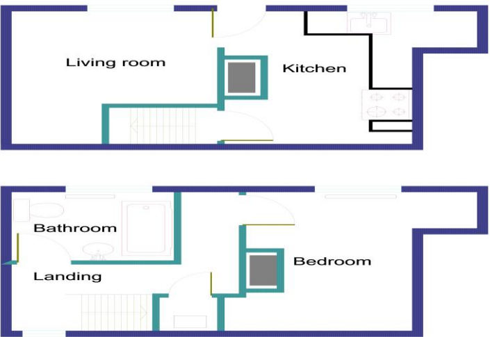
Floor area 492 sq' approximately. N.B:Not to scale,for guidance only.

Window to front southern aspect. Radiator. Understairs recess.