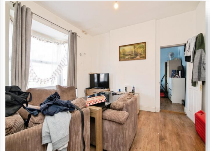
Edgbaston Road, Smethwick B66 4LG