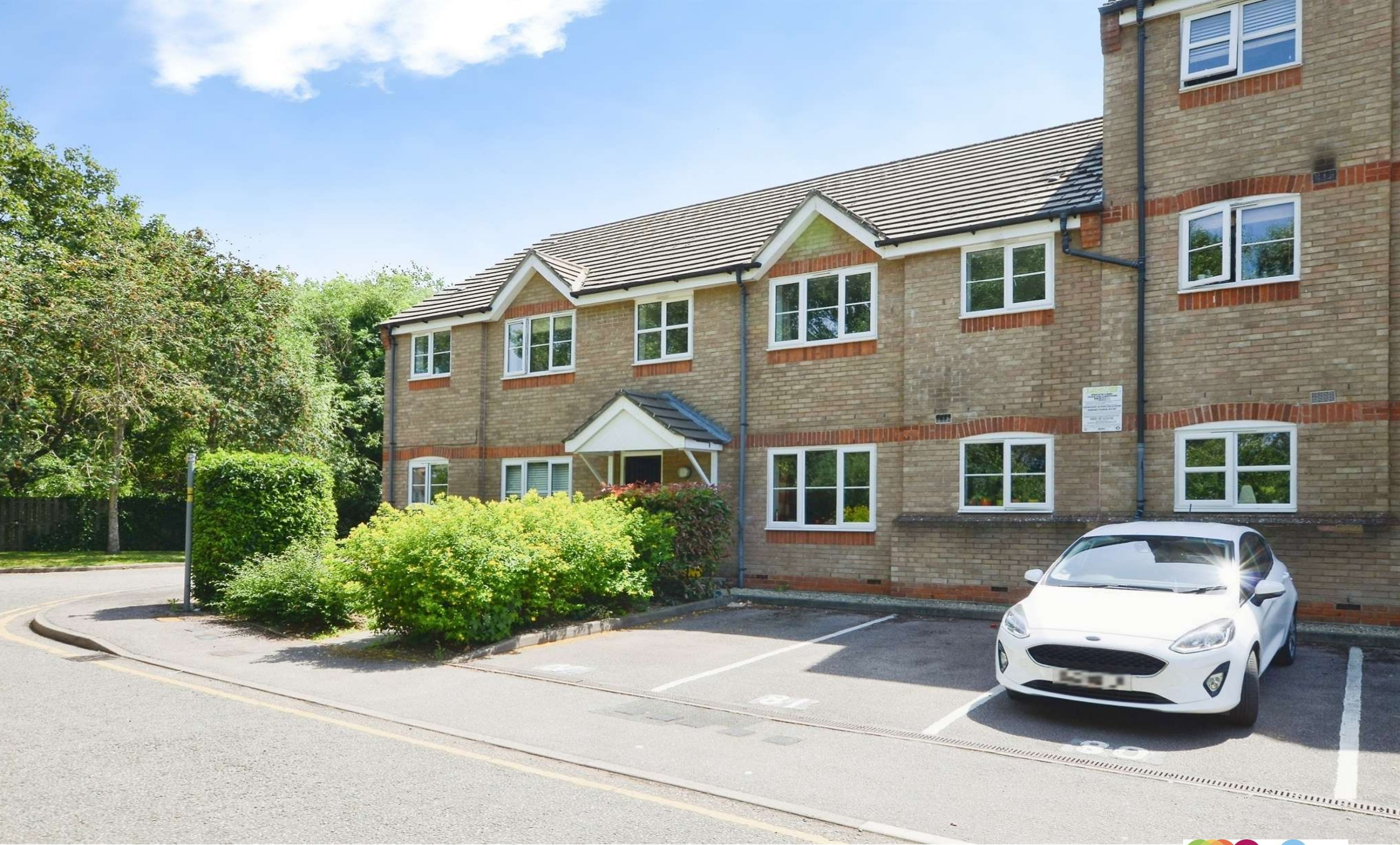
Hilda Wharf, Aylesbury HP20 1RJ