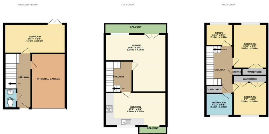
This Floor Plan is for guidance only and is NOT to SCALE Made with Metropix ©2024

Please note the marketing photos for this property were taken before the current tenancy commenced.