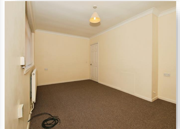
Mendip Grove, Peterborough PE4 7TX