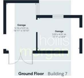
Ground Floor Building 7

Approximate total area (1) 404.4 m 2 4356 ft 2