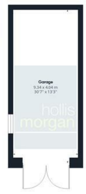
Ground Floor Building 4