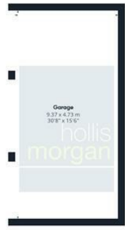
Ground Floor Building 5