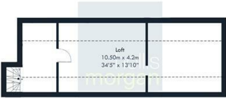
Second Floor Building 1