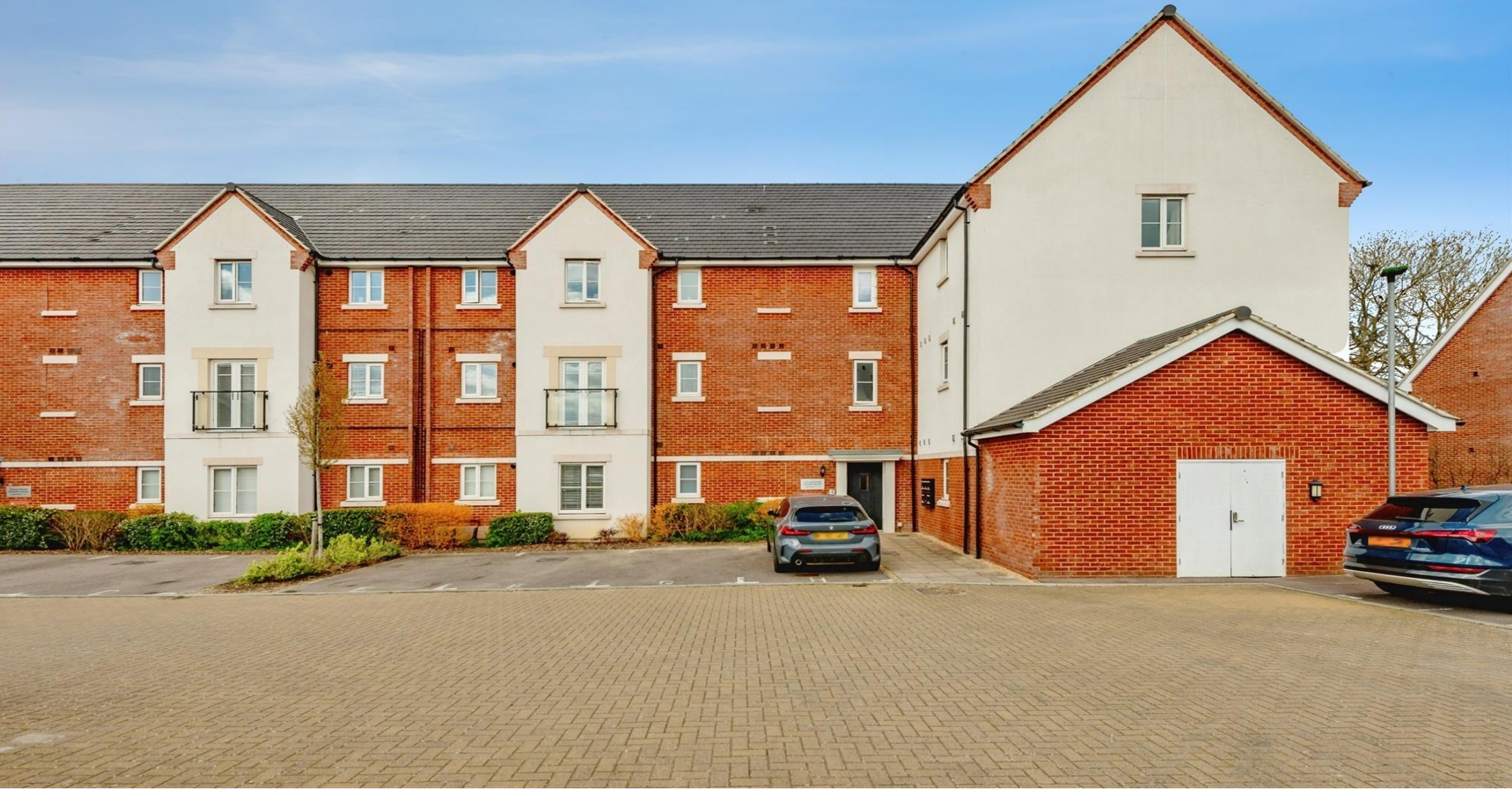
Crocus House Daffodil Crescent, Crawley RH10 3GQ