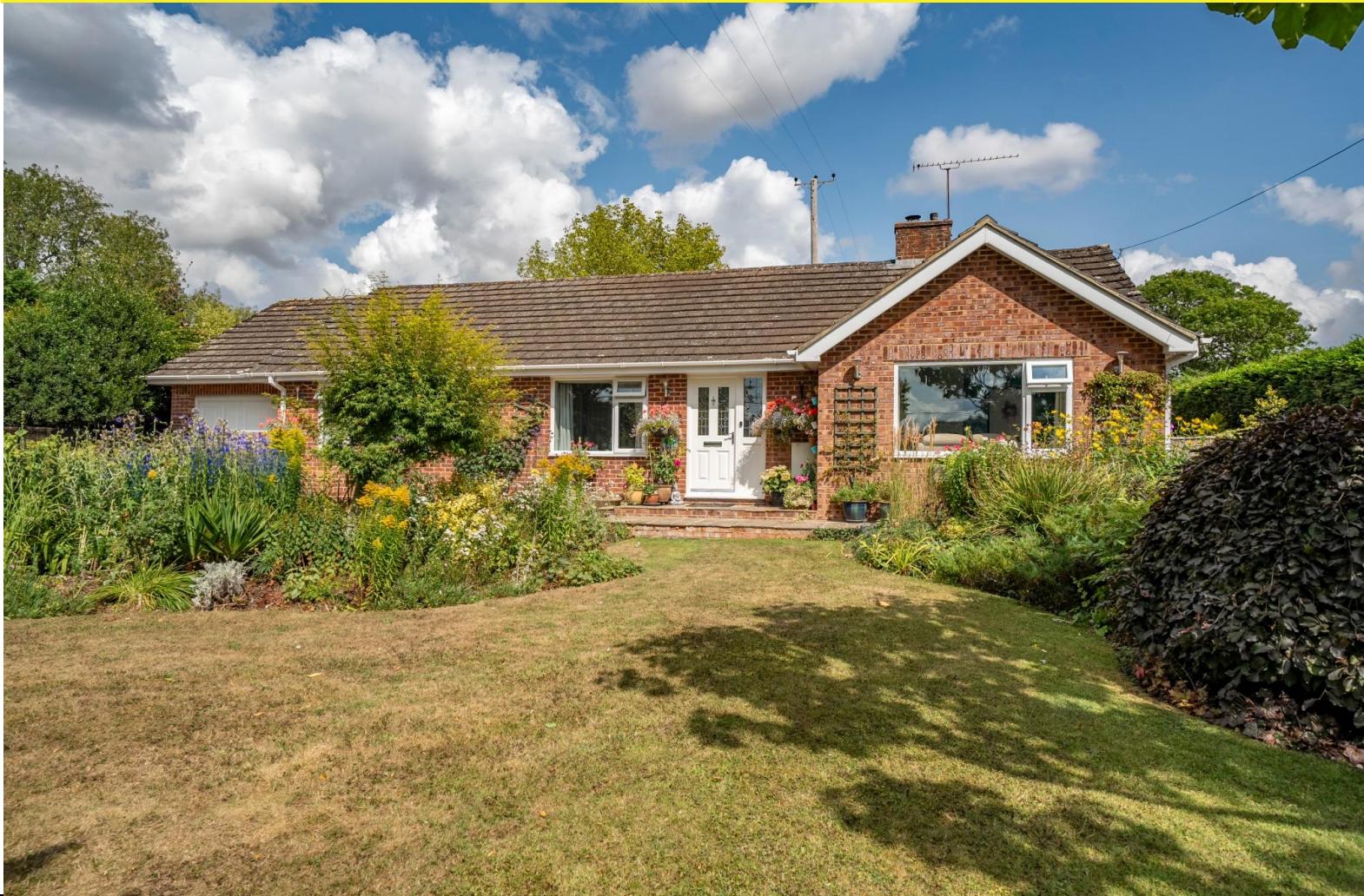
Three Oaks, Tangley Guide Price £725,000 Freehold

NOTE: These particulars are only intended as a guide to prospective purchasers with a view to taking up negotiations. They are not intended to be relied upon in any way for any purpose and accordingly neither their accuracy nor their continued availability is in any way guaranteed. They are furnished on the express understanding that neither the Agents nor the Vendors are under any liability or claim in respect of their contents. Any prospective purchaser must satisfy themselves by inspecting or otherwise as to the correctness of the particulars contained.