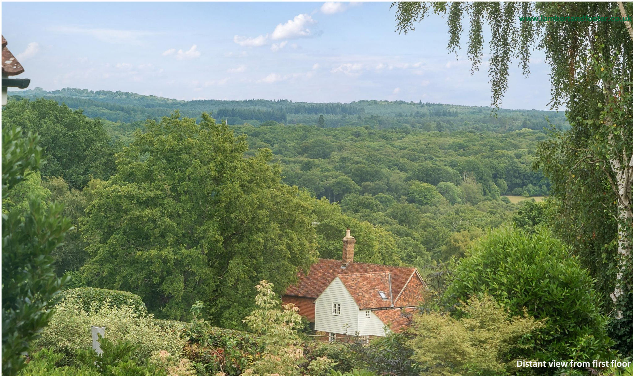
Distant view from first floor