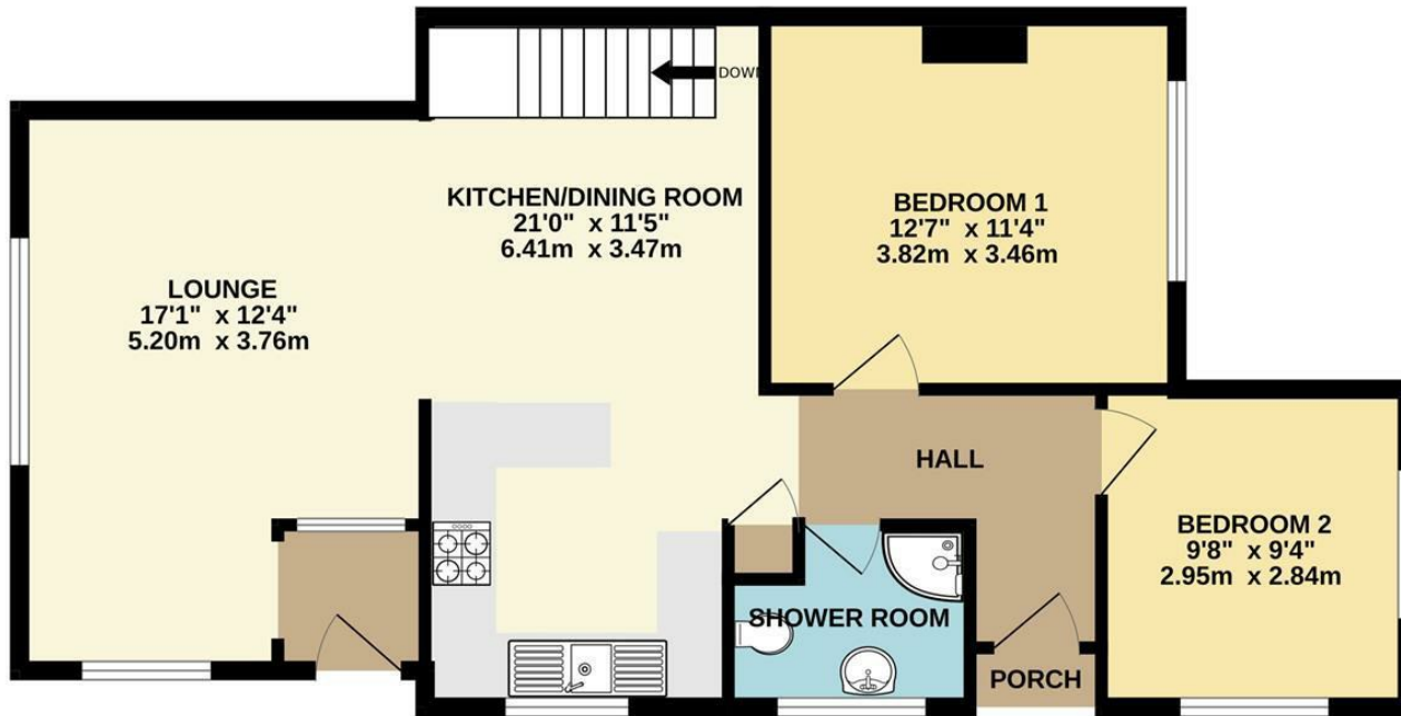
1ST FLOOR 211 sq.ft. (19.6 sq.m.) approx.