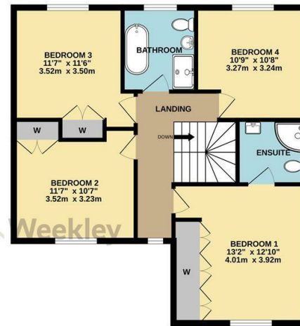
1ST FLOOR 718 sq.ft. (66.7 sq.m.) approx.