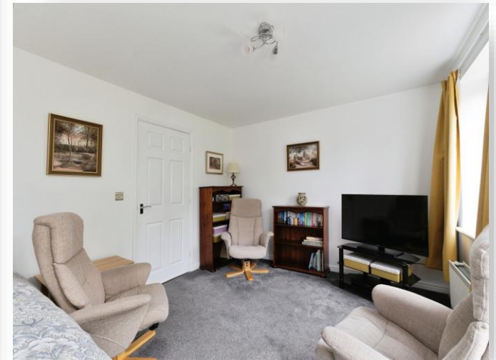
Poppy Close, Ormesby Middlesbrough TS7 9JG