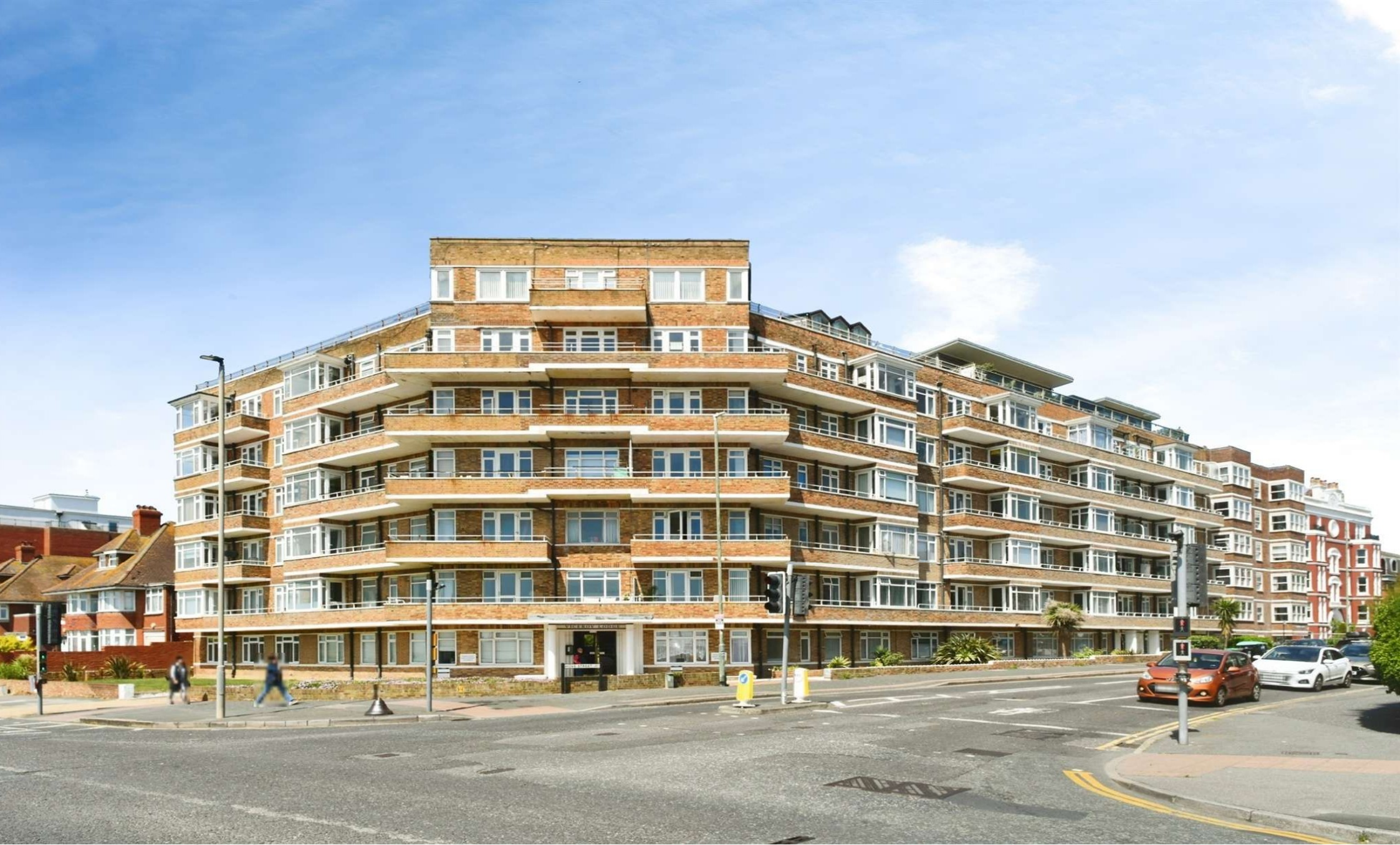
Viceroy Lodge Kingsway, Hove BN3 4RA