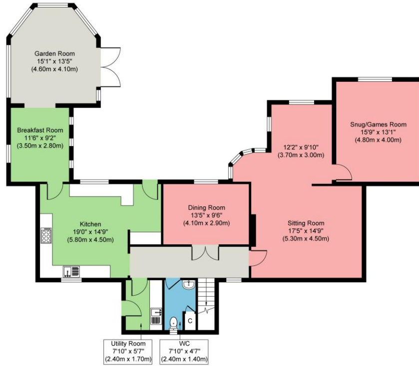
Ground Floor Approximate Floor Area 1,521 sq. ft (141.33 sq. m)