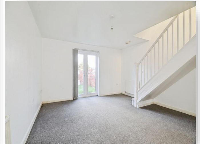
Brunel Walk, Stockton-On-Tees TS19 8RG