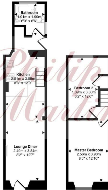
Ground Floor Approx 27 sq m / 293 sq ft