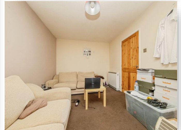
Hale Close, Ipswich, IP2 9QP