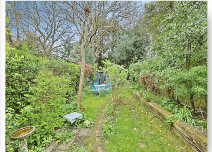
Millgate, Aylsham, Norwich, NR11 6HX