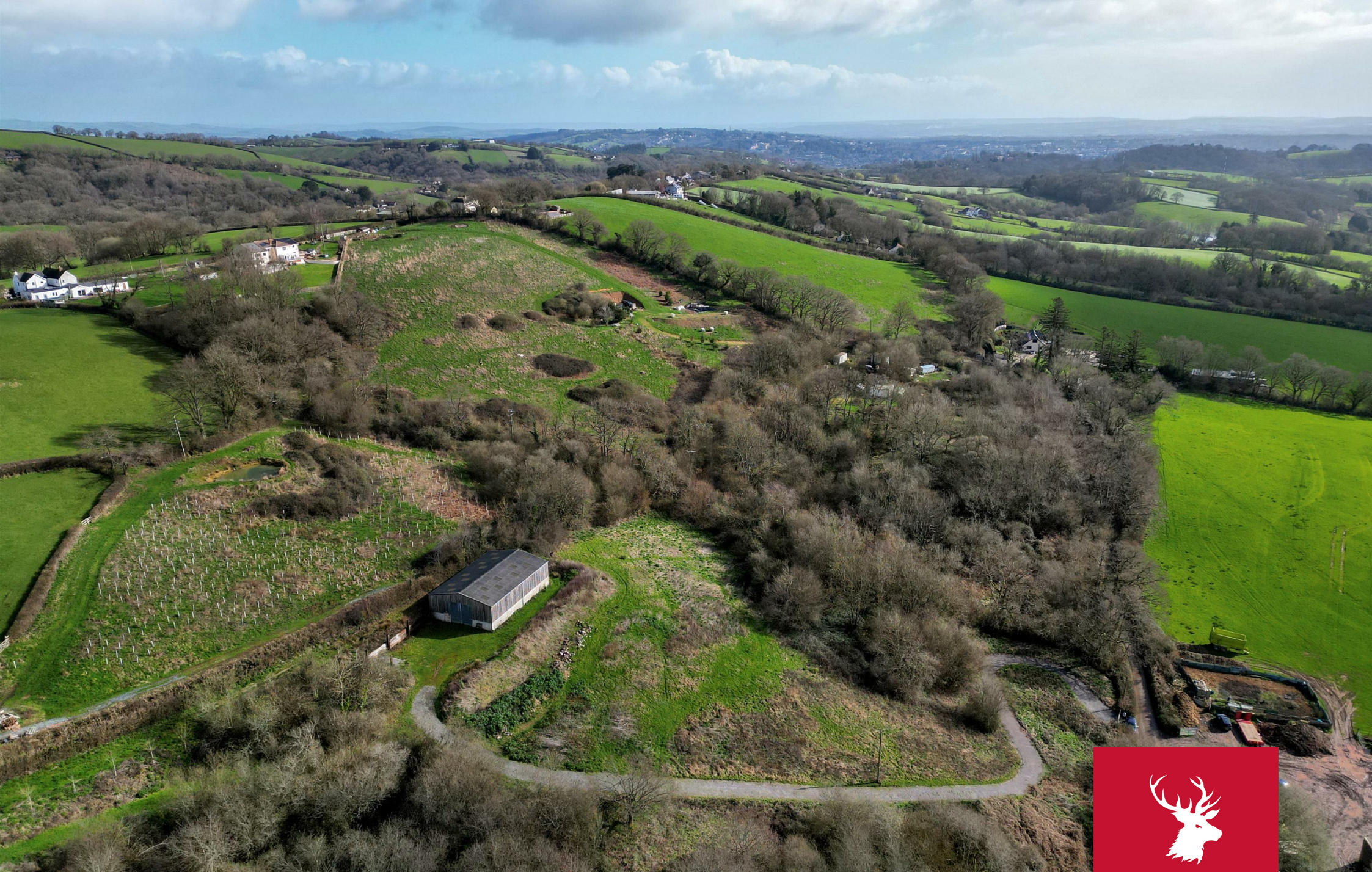
Hill Farm Barn