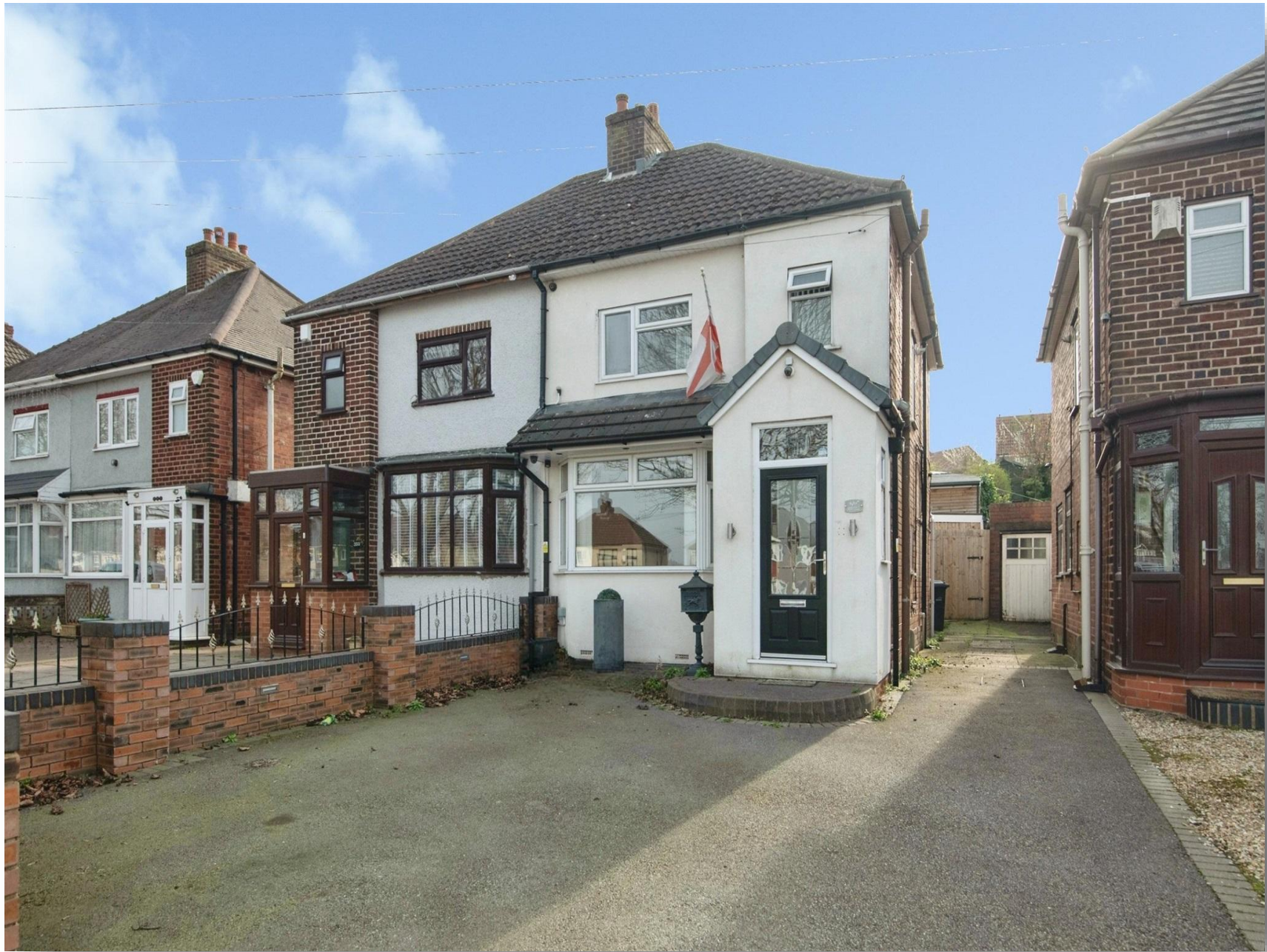
Birmingham New Road, Dudley DY1 4SJ