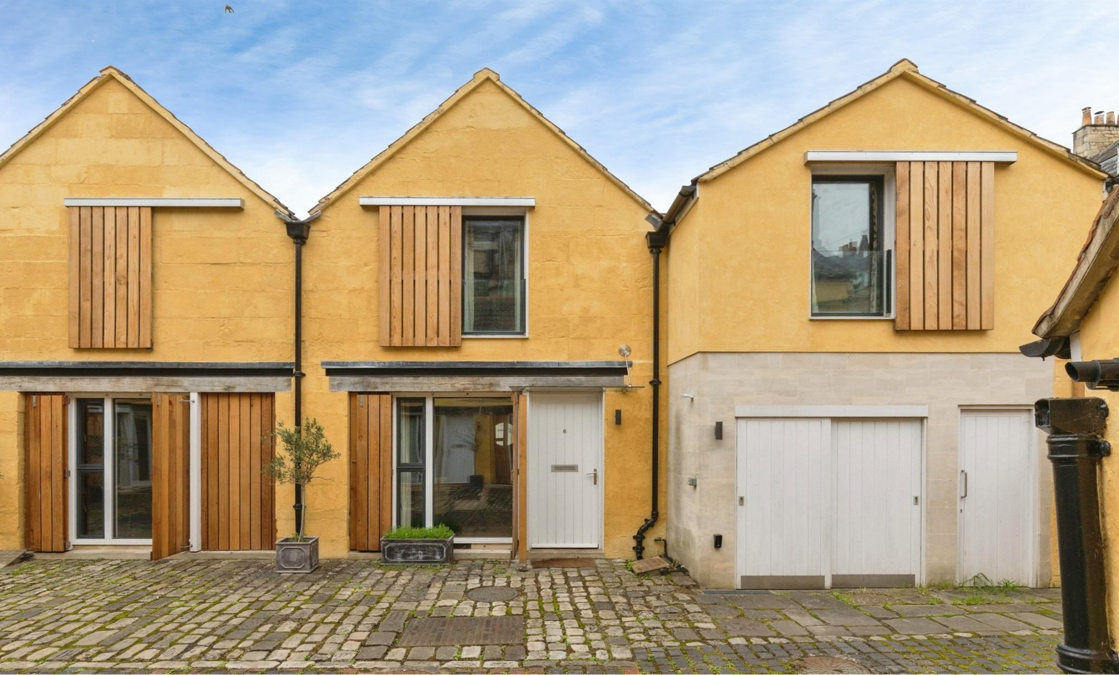
Rivers Street Mews, Bath BA1 2QD