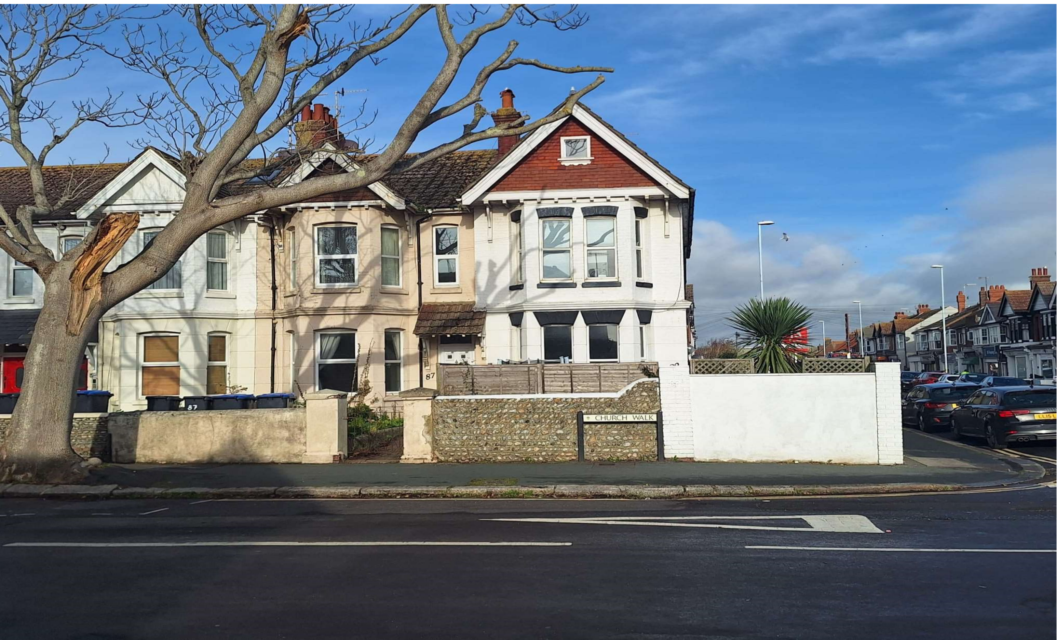
Church Walk, Worthing BN11 2ND