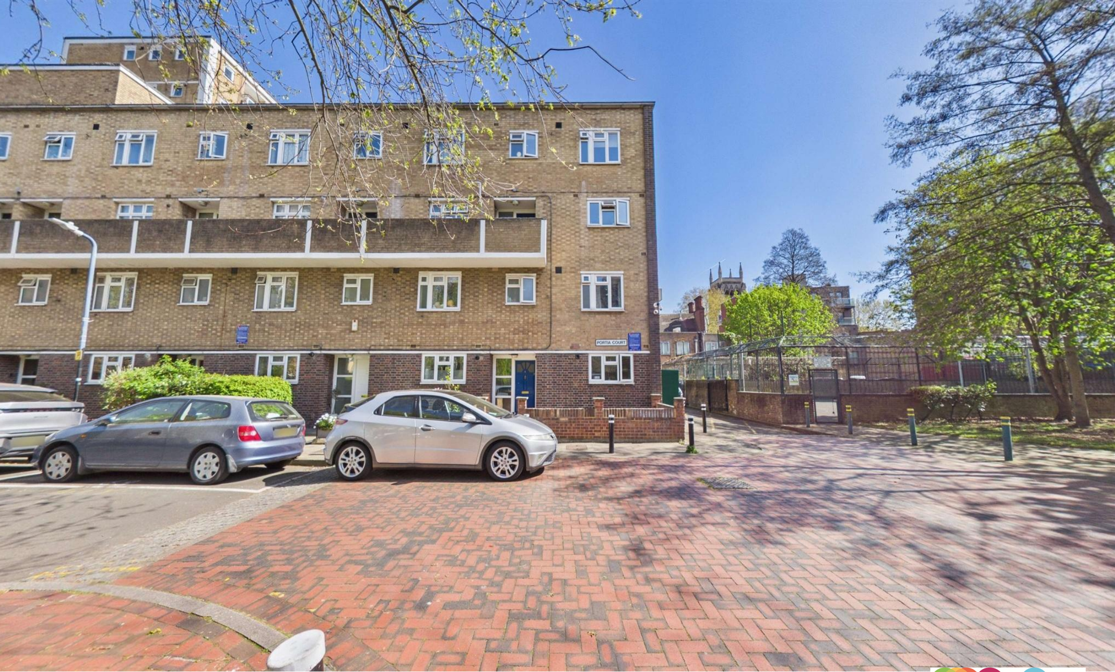
Portia Court Opal Street, London SE11