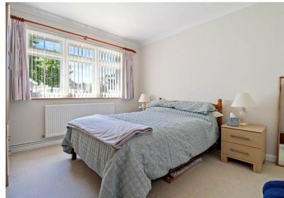
Bedroom 8'7 x 8'5 (2.62m x 2.57m)