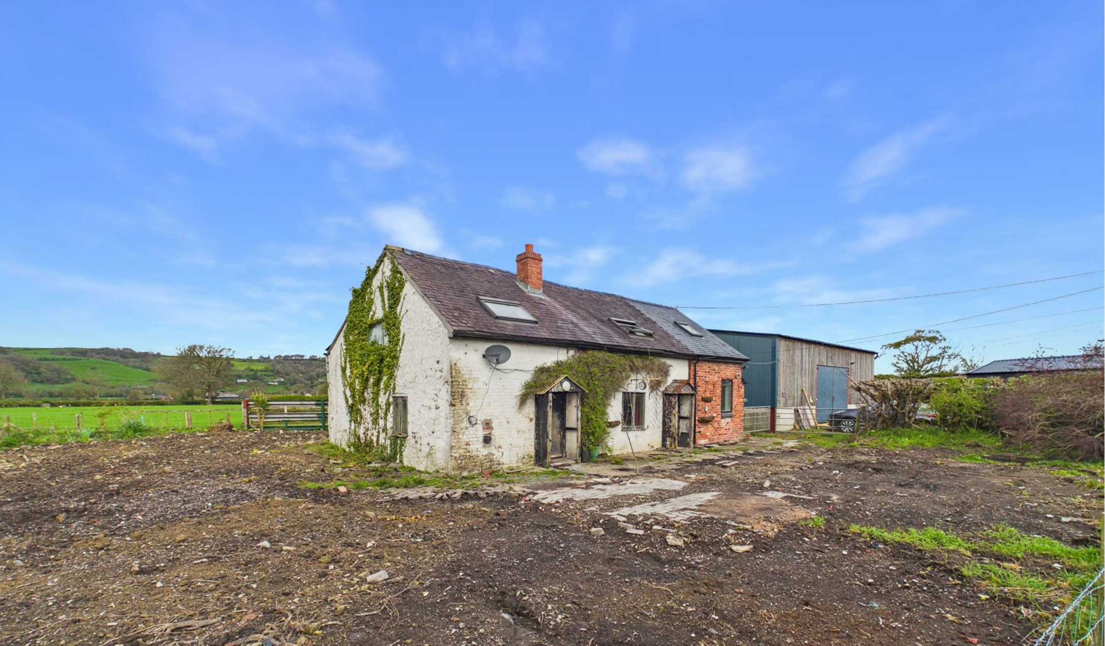
Malt House, Trehelig, Welshpool, SY21 8SG