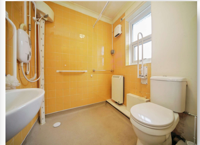
Town Green, Stowmarket, IP14 1SU